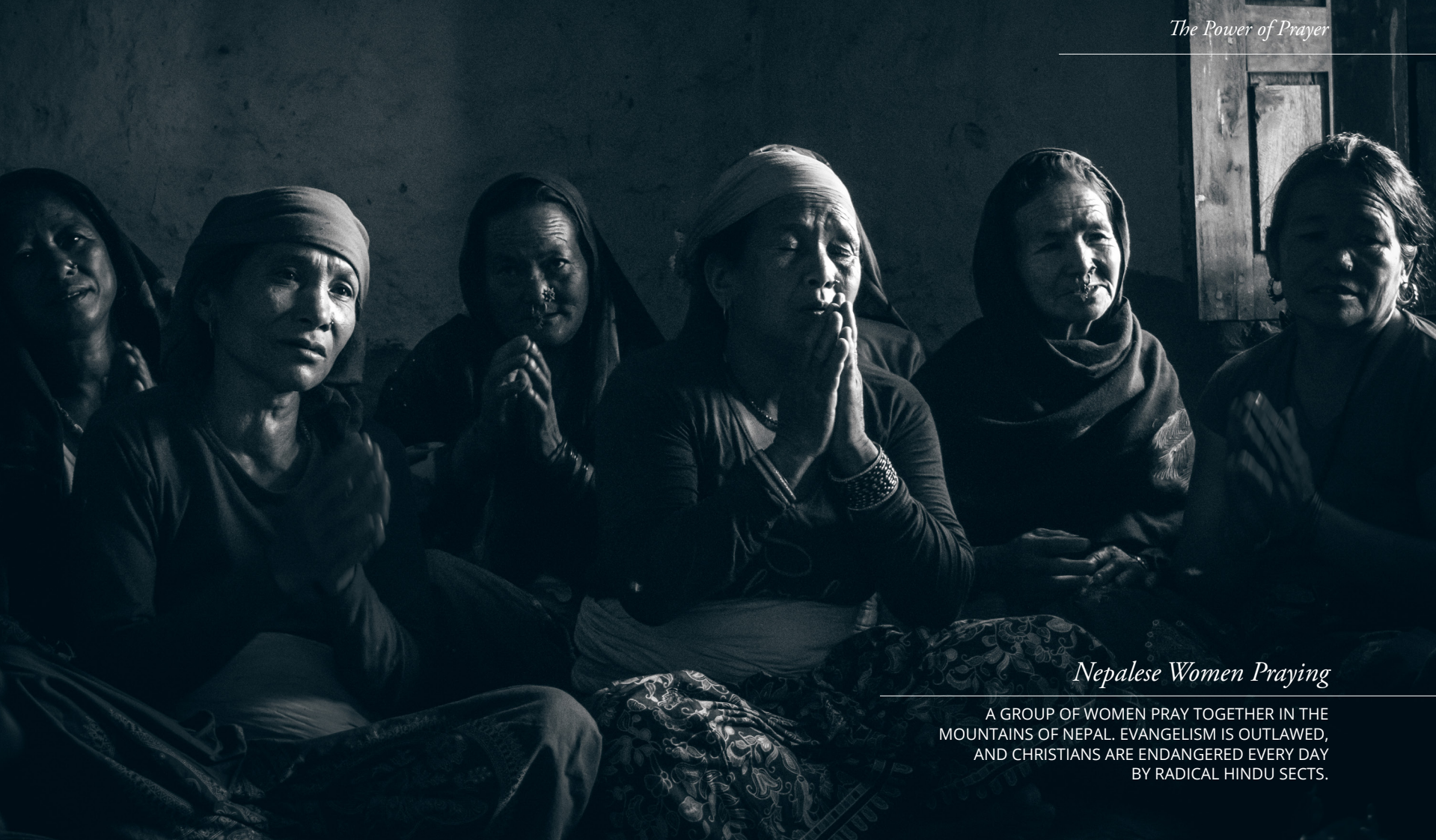
Nepalese Women Praying

Secondly, unbelief is a great enemy of prayer. Do we really believe in our utter inability to win even one soul of the eight billion that now reside on this planet? Do we really believe that God is "able to do far more abundantly beyond all that we ask or think, according to the power that works within us?" 4 Do we really believe that prayer is absolutely essential and