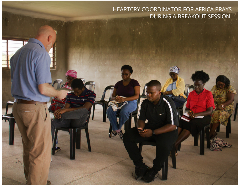
HEARTCRY COORDINATOR FOR AFRICA PRAYS DURING A BREAKOUT SESSION.