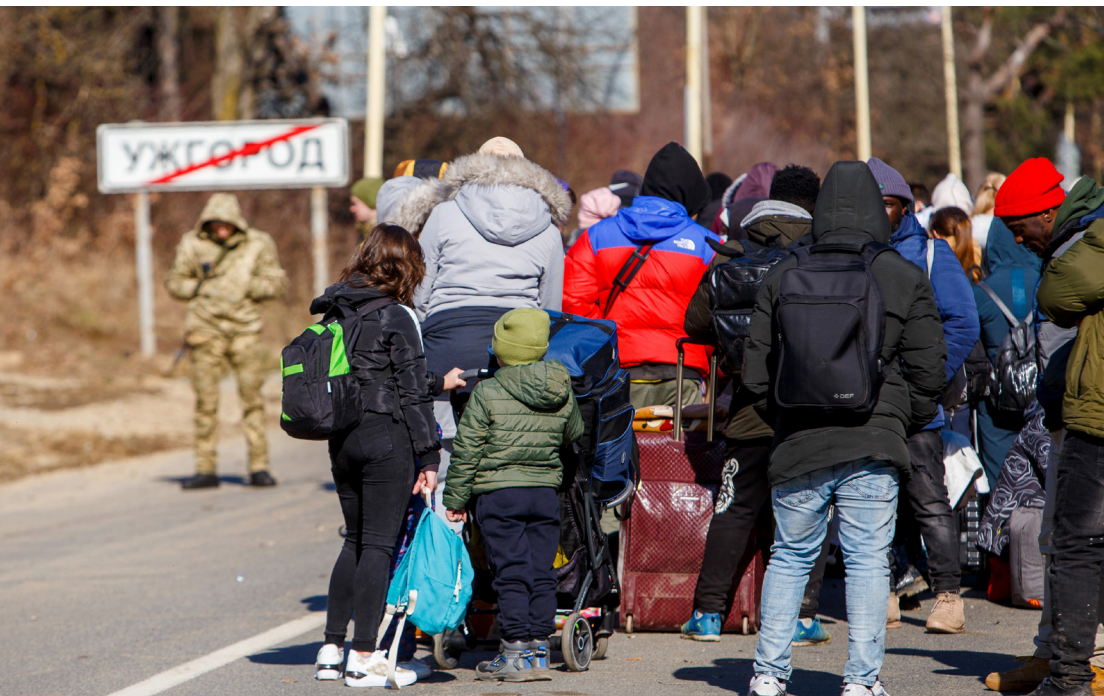
REFUGEES CROWD AT THE UZHGOROD-VYSNE NEMECKE CHECKPOINT ON THE UKRAINE-SLOVAKIA BORDER IN THE WEST.