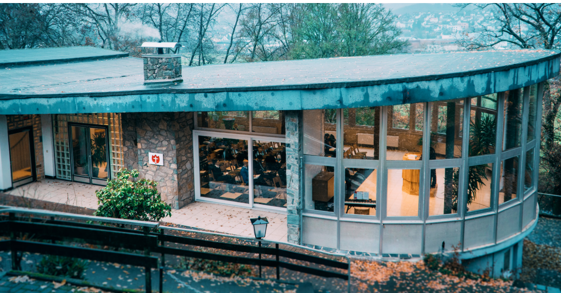
EVANGELISCH-REFORMIERTE BAPTISTENGEMEINDE. EVANGELICAL-REFORMED BAPTIST CHURCH IN WETZLAR HAS BEEN BLESSED WITH A DIVERSE CONGREGATION OF LOCAL GERMANS AS WELL AS IMMIGRANTS FROM AFRICA, ASIA, AND BEYOND.

Missionaries, like all other believers, are sinners; they live daily through the mercy of God covering their sin by the blood of Christ and restoring their faith through the work of the Spirit. Yet the sins and weaknesses of a worker of the gospel jeopardize more than his personal faith and life. They risk the reputation of the gospel and weaken the trust of believers. Through wrongly communicated hopes, unspiritual means, or false expectations, they may hinder and even discourage or scare off those who have been close, who have been near, who have been greatly influenced, and who have been involved. In the story of Abraham, the angel of the Lord goes after Hagar and overrules the sins of the patriarch. He also saves Sarah twice out of the harem of another man. Who could bear just one day working for souls without trusting that God has