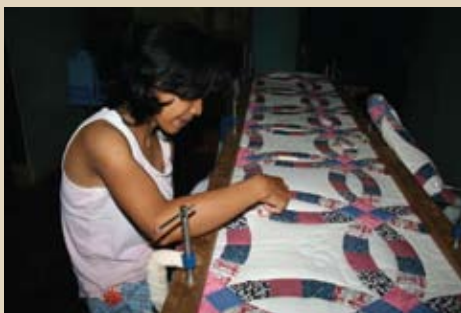
A woman from Palalangon is sewing attentively. She is a Christian and her husband is a poor rice farmer. They barely make ends meet. She pays her son’s tuition with the money she earns from quilt making.

The women almost always sew together in a group and spend all day in discussion. Many times, one will find a group of three or four strong Christian ladies sewing together with several Muslim women. The business is open to Muslims so that they might hear about the love of Jesus even as they earn needed money for their families. Although the quilt project is a “humanitarian” ministry, it is primarily an evangelistic tool with the goal of winning souls through the bonds of friendship.