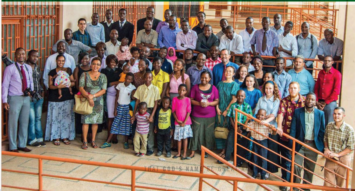
Members of Antioch Baptist Church in Blantyre, Malawi

Grace to you all! Thank you for your prayers!