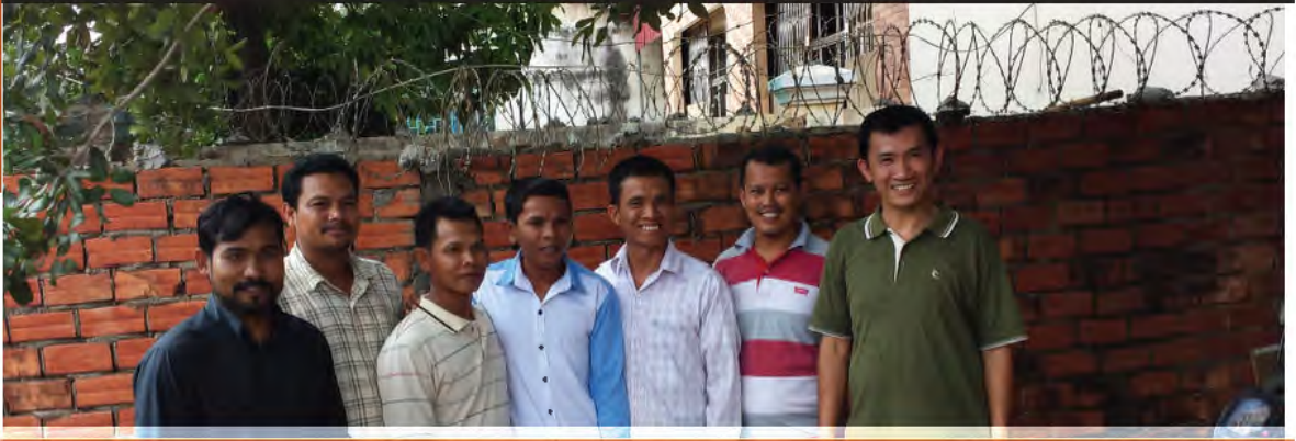
Seven Cambodian missionaries who attended the conference and are currently supported by HeartCry. Please pray for these men as they serve Christ in the midst of great opposition.