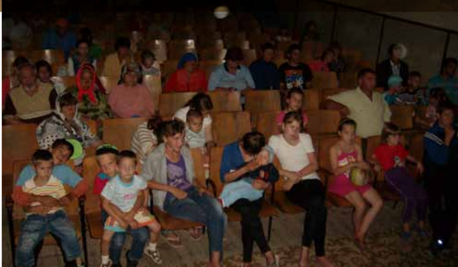
Evangelistic meeting in the Culture House in the town of Mahmudia of Tulcea County.

in the heart of the delta, sleeping in tents and meeting fishermen that were fishing on the canals. It was fascinating to see their life, understand their customs, and share with them the Good News that even fishermen in the isolated land of the Danube Delta are loved by God and called to be saved.