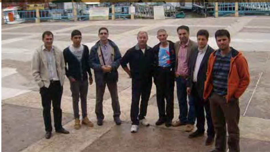
Part of the HeartCry Team visiting a little port in Tulcea, the main city on the Danube Delta.

thodoxy. It is mostly committed to the rituals of the denomination, but it has no real spiritual life. The other is a community of Russian-speaking people called “Lipoveni.” They are very different from the followers of typical Eastern Orthodoxy. They have their liturgy in an old Slavic language and follow a different religious calendar.