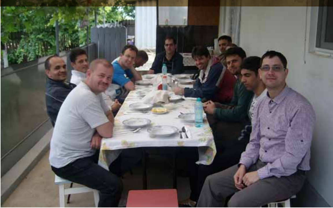
The HeartCry missionary team having breakfast before going to the streets of Mahmudia and Nufaru.

The days were rainy, but there was no hindering us in going and reaching out to the people on the streets. One day at breakfast, it was pouring rain, and there was a bit of concern about what we were going to do if it did not stop. One missionary prayed that God would make a window in the sky so that we could preach the Gospel to the town of Nufaru. When we drove to the village, we saw a miracle. All around the village were storms and floods, but not one drop of water fell in the town of Nufaru! The village was blessed that day with the rain of the glorious Gospel, and some hearts became the good ground on which the seed of the Gospel fell!