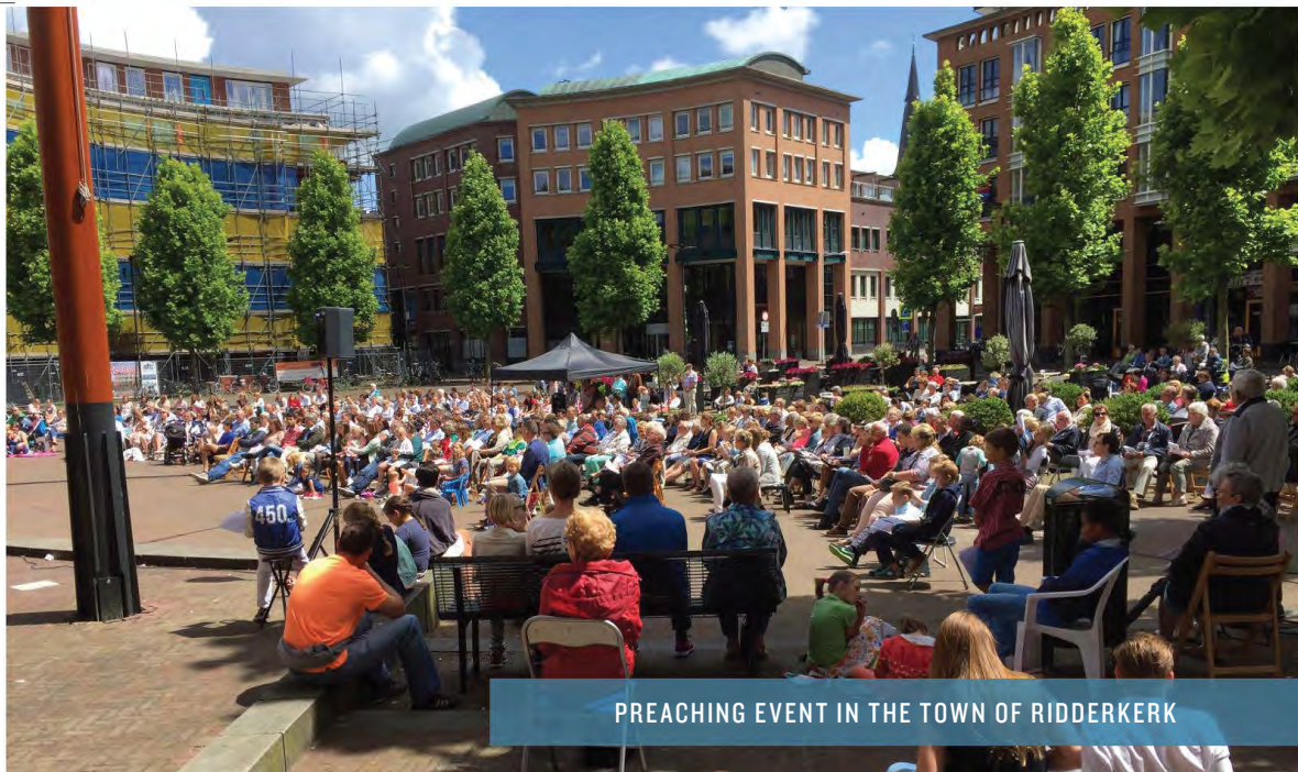
PREACHING EVENT IN THE TOWN OF RIDDERKERK

with the children. We are grateful to the Lord that we were able to do a lot of work recently. We are grateful that God has been faithful to give us strength and health for our work each day.